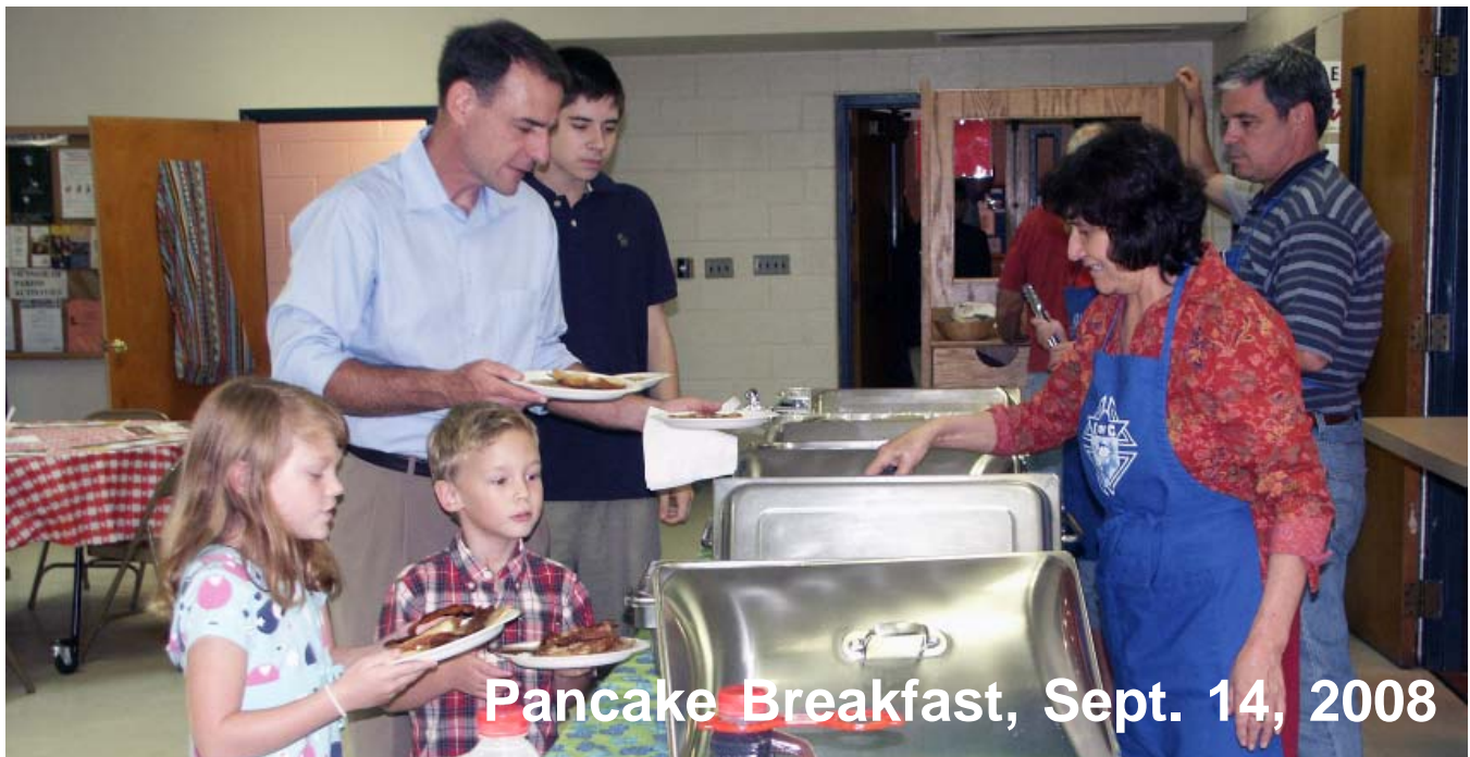
Pancake Breakfast, Sept. 14, 2008